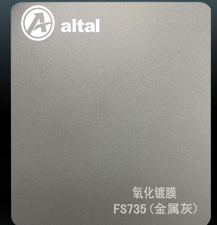
FS735 (Metallic Grey)