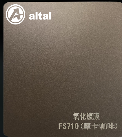
FS710 (Mocha Coffee)