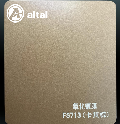
FS713 (Khaki Brown)