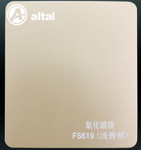
FS619 (Light Champagne)