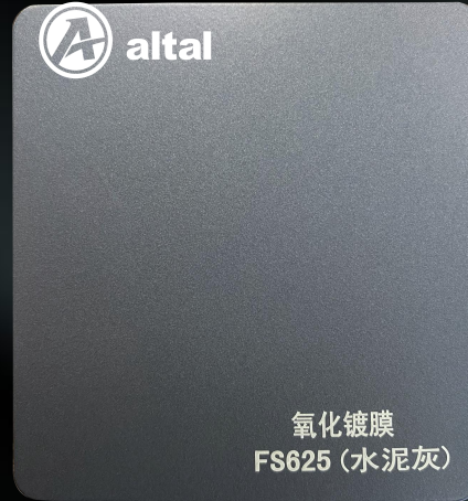
FS625 (Cement Grey)