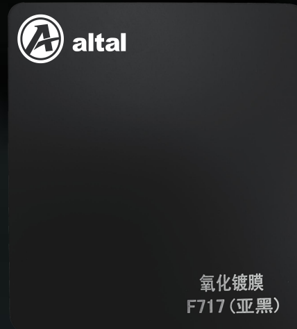
FS717 (Matte Black)