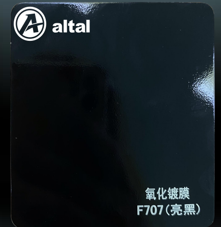
FS707 (Glossy Black)