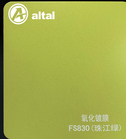
FS830 (Pearl River Green)