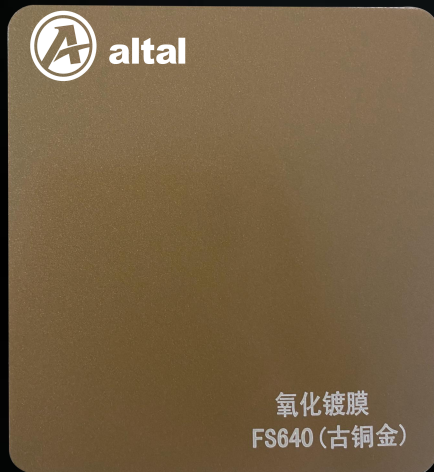
FS640 (Bronze Gold)