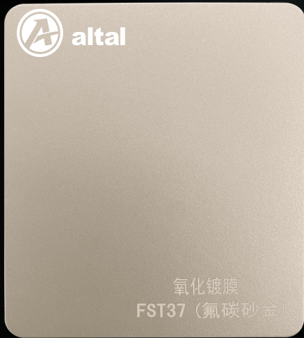
FST37 (Fluorocarbon Sand Gold)