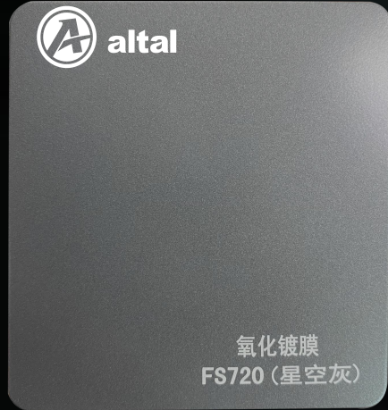
FS720 (Starry Grey)