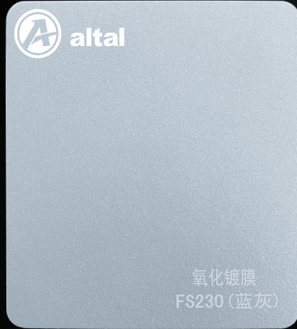
FS230 (Grey Blue)