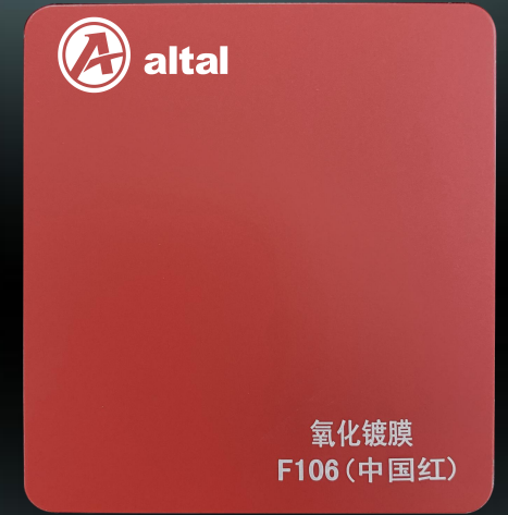
FS106 (Chinese Red)