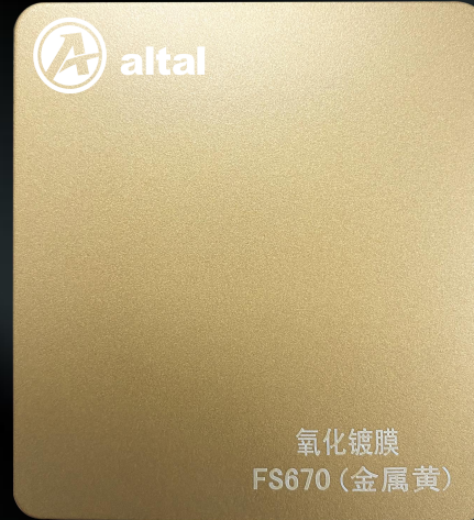
FS670 (Metallic Yellow)