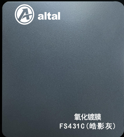
FS431C (White Shadow Grey)