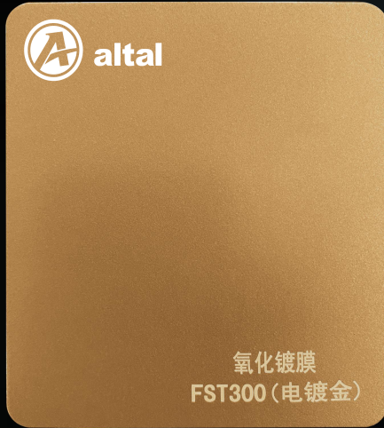
FST330 (Electroplated gold)