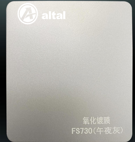
FS730 (Midnight Grey)