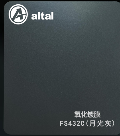
FS432C (Moon Grey)