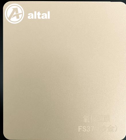
FS37 (Sand Gold)