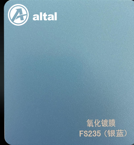
FS235 (Silver Blue)