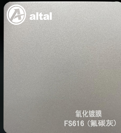
FS616 (Fluorocarbon Grey)