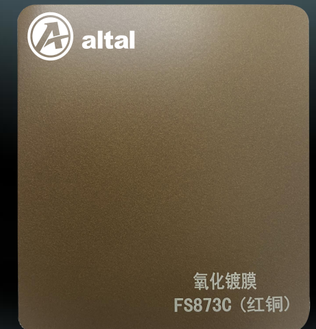
FS873C (Red Copper)