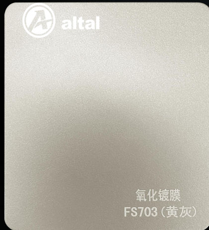
FS703 (Yellow Grey)