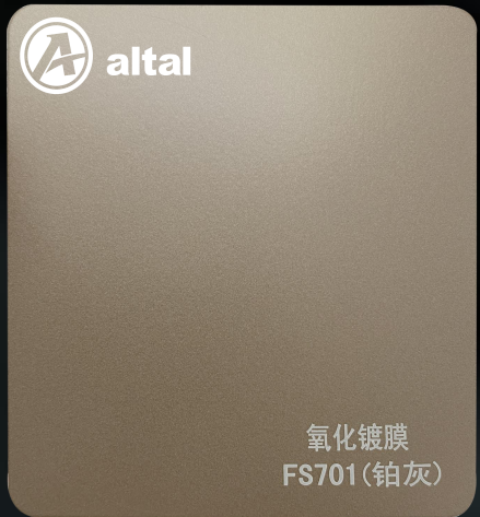
FS701 (Platinum Grey)