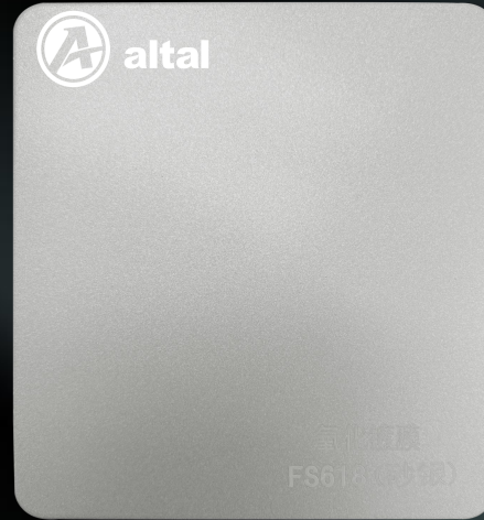
FS618 (Sand Silver)