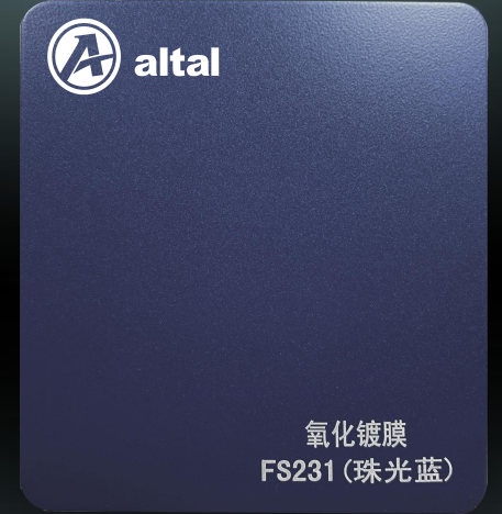
FS231 (Pearl Blue)