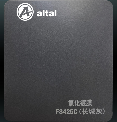
FS425C (Great Wall Grey)