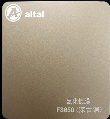
FS650 (Deep Bronze)