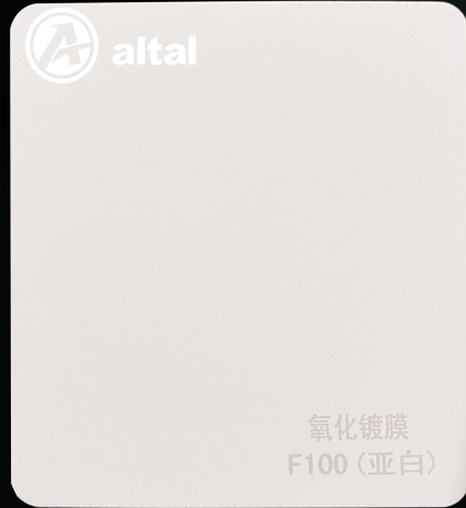
F100 (Matte White)