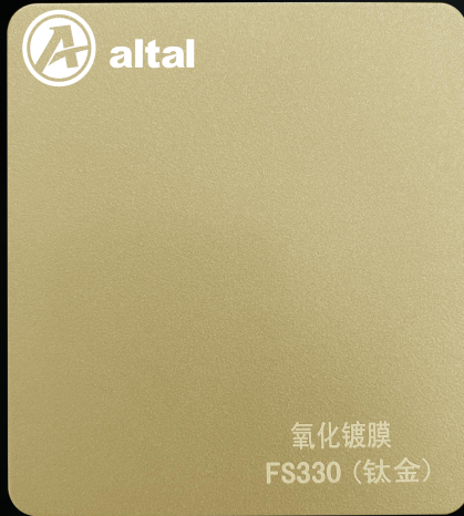
FS330 (Titanium Gold)